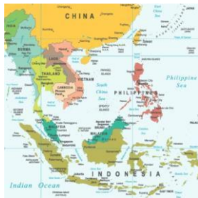
Map of Thailand