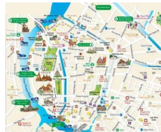
Map of Bangkok, Thailand